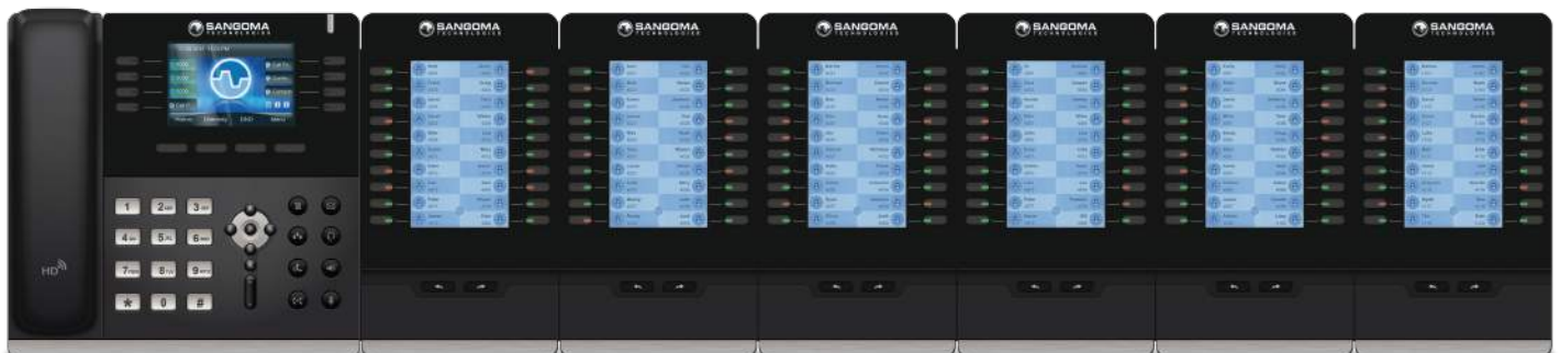
Daisy-chain Up to 6 Modules